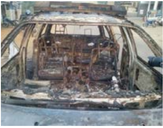
Pictures taken at the beginning of March 2018 in Belo, showing a burnt Toyota Picnic. According to evidence collected by Amnesty International, the vehicle was set ablaze by security forces manning a checkpoint at the Belo motor park on 2 February 2018.